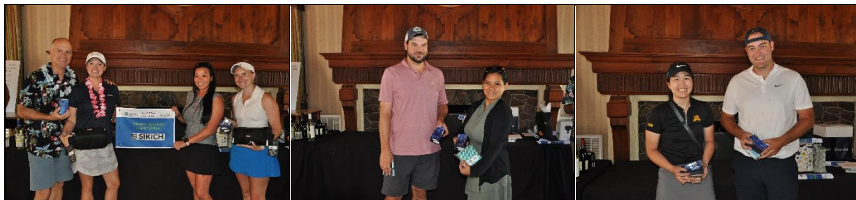
Longest Putt Hole 1 Sponsored by Sikich Longest Drive Hole 3 Sponsored by IIA Chicago Closest to Pin Hole 4 Sponsored by IIA Chicago