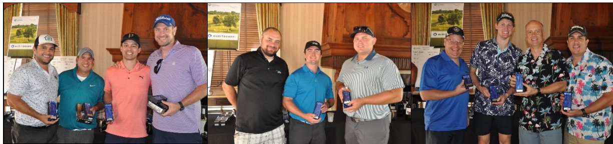
Gold Flight Team Scramble Silver Flight Team Scramble Bronze Flight Team Scramble