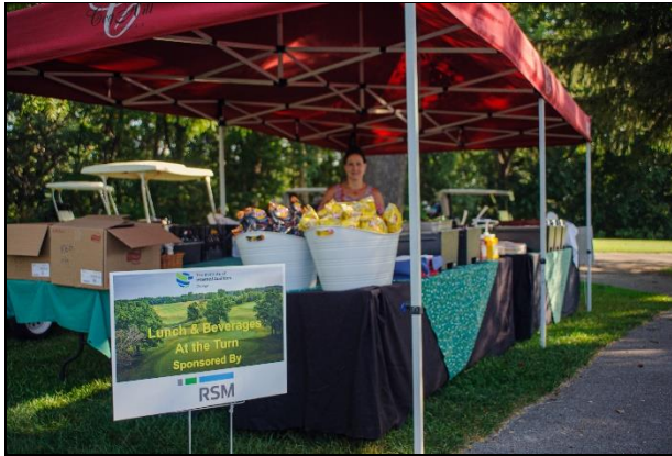
RSM Lunch & Beverages At the Turn