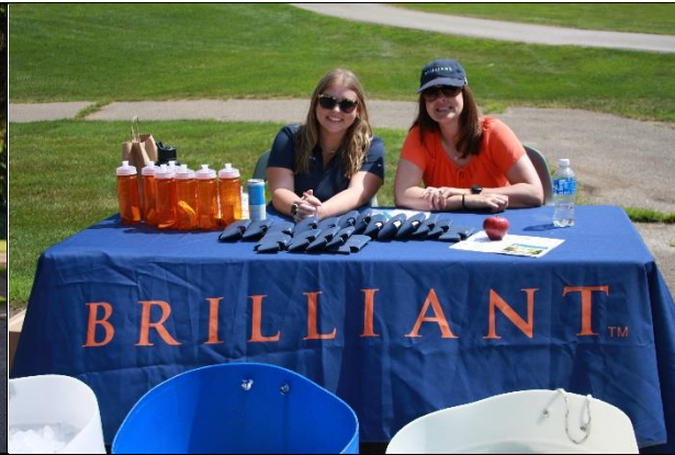
Brilliant On-course Beverages