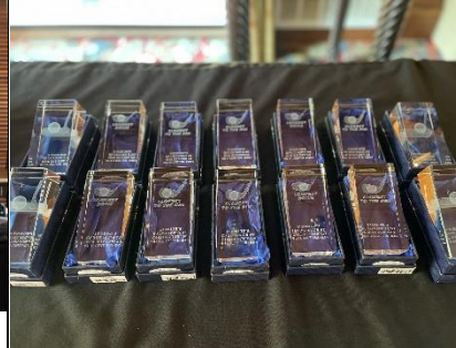
AuditBoard Reception & Awards Banquet