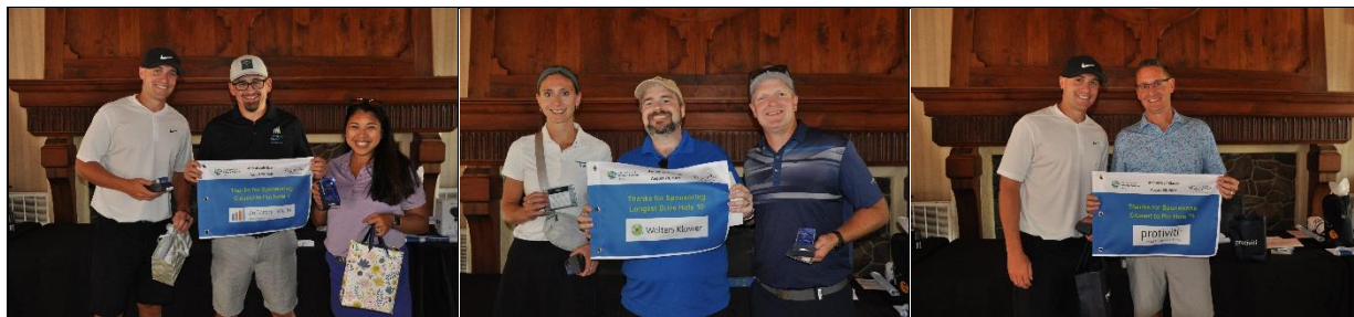
Closest to Pin Hole 7 Sponsored by Jefferson Wells Longest Drive Hole 10 Sponsored by Wolters Kluwer Closest to Pin Hole 14 Sponsored by Protiviti