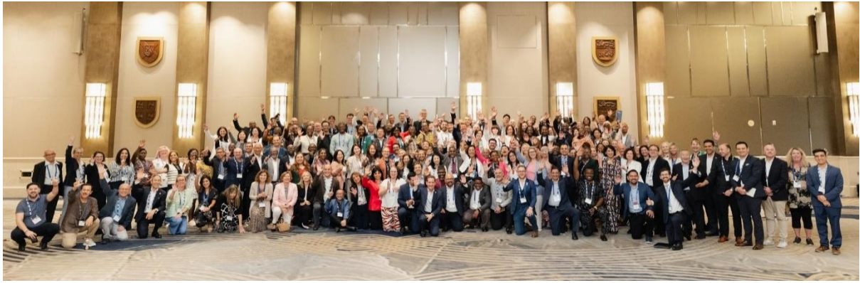
Figure 15: Global Assembly Delegates