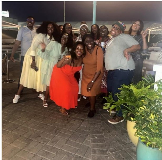
Figure 34: AFIIA Group posing for a picture at Rebel Night Club

“We often get so caught up in work that we forget to have fun, so it was wonderful to see fellow internal auditors outside the conference setting letting loose” Ms. Khupe mentioned.