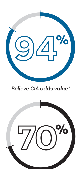
CAEs prefer to hire CIAs**