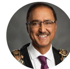
Amarjeet Sohi Mayor of Edmonton