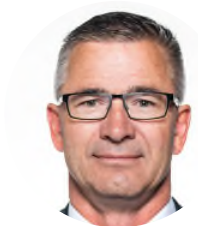
Travis Toews President of Treasury Board, Minister of Finance