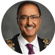
Amarjeet Sohi Mayor of Edmonton