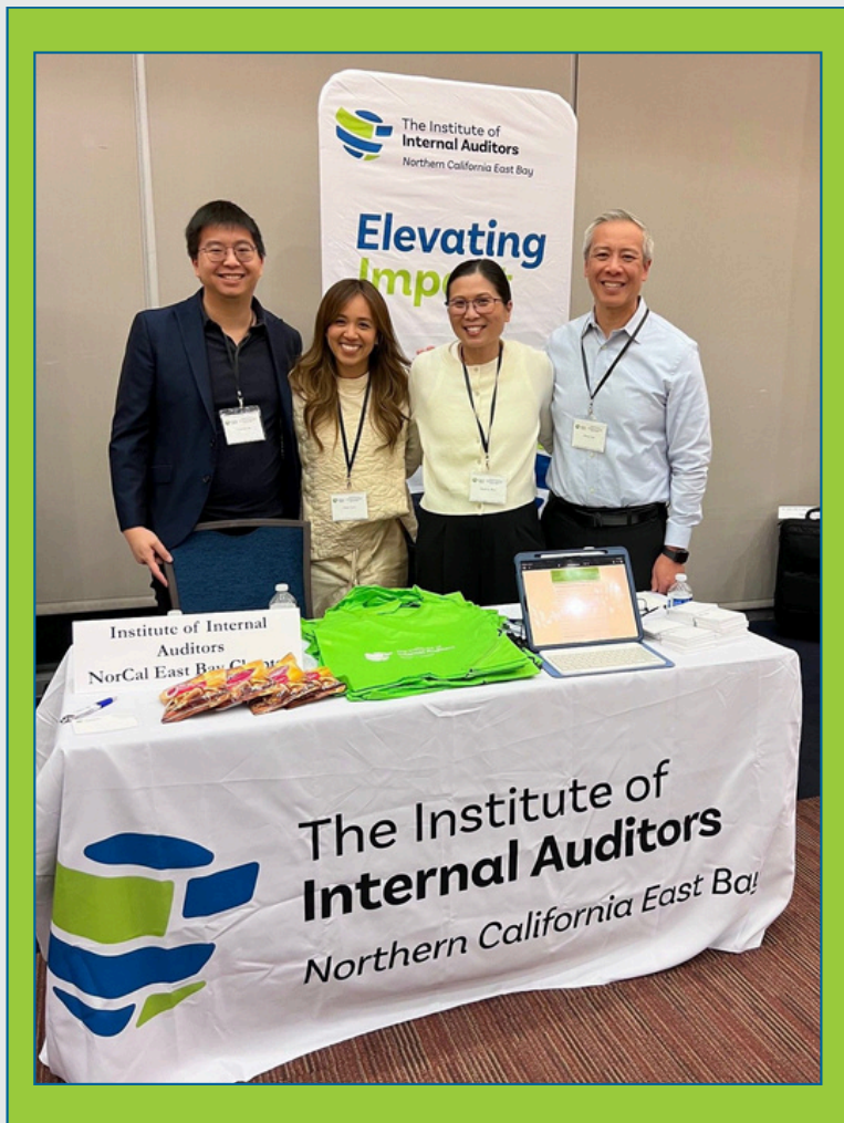
CSU East Bay Business Career Association Night