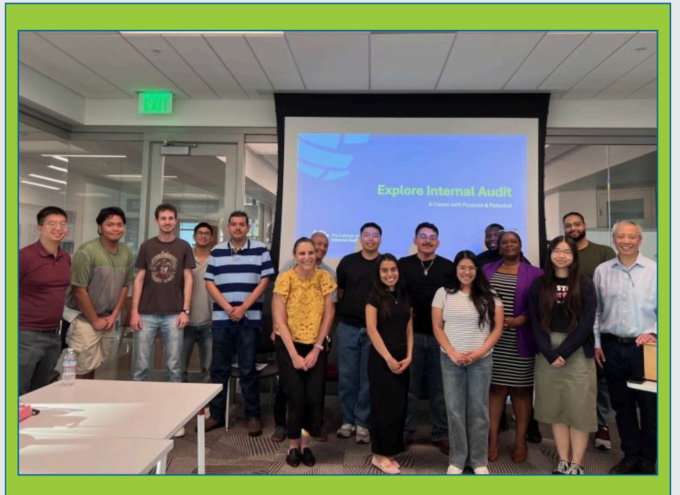
CSU East Bay Beta Alpha Psi Pizza Night

Through our Academic Relations efforts, the chapter connects with students and universities to promote awareness of internal auditing as a rewarding career path. These engagements help develop the next generation of professionals while strengthening the future of our profession. The IIA offers free student memberships, giving students access to grants & scholarships, career resources and discounts on IIA credentials.