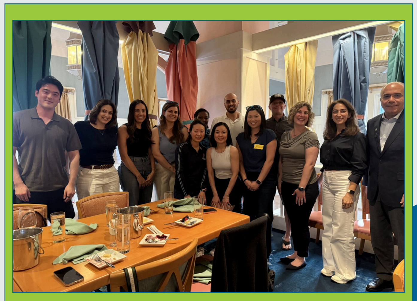
West District 2 Representatives