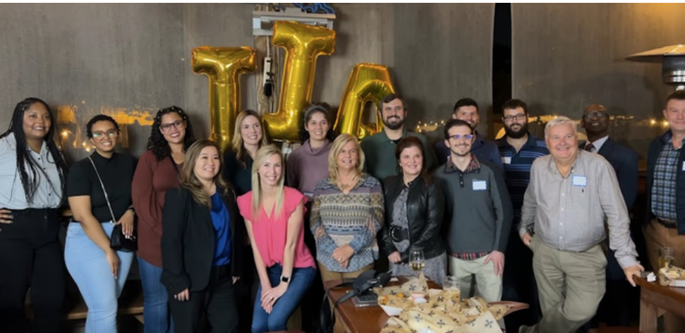
Fall Social - Bayou Beer Garden

May 2023 - IIA New Orleans and Baton Rouge are partnering for an in-person seminar in New Orleans. Keep an eye on upcoming emails and LinkedIn posts!