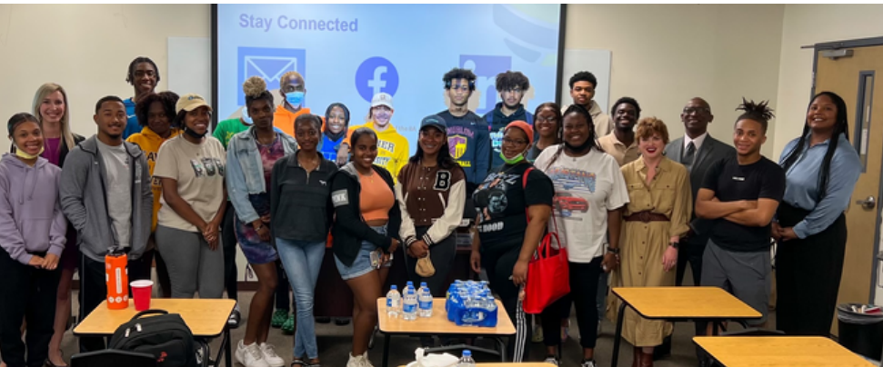
Xavier University - NABA Presentation