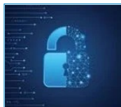
2022 Cybersecurity Conference | October 27, 2022