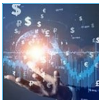
2022 Financial Services Exchange | Sept 19 - 20, 2022