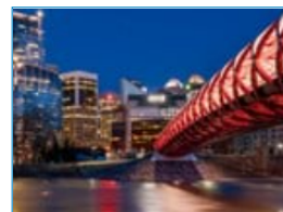
Canada National Conference | October 16-19, 2022