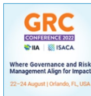
2022 GRC Conference | August 22 - 24, 2022