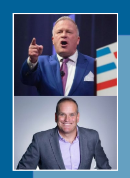
Spring Seminar – Cybersecurity & Leadership