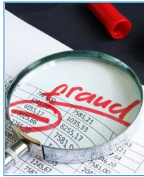
Risk, Fraud, and Illegal Acts