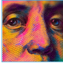
2023 Financial Services Exchange Sept 11, 2023 through Sept 12, 2023