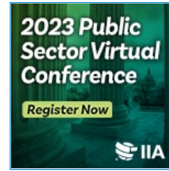
2023 Public Sector Virtual Conference June 29, 2023