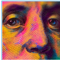
2023 Financial Services Exchange Sept 11, 2023 through Sept 12, 2023