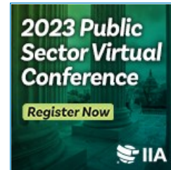
2023 Public Sector Virtual Conference June 29, 2023