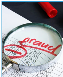
Risk, Fraud, and Illegal Acts