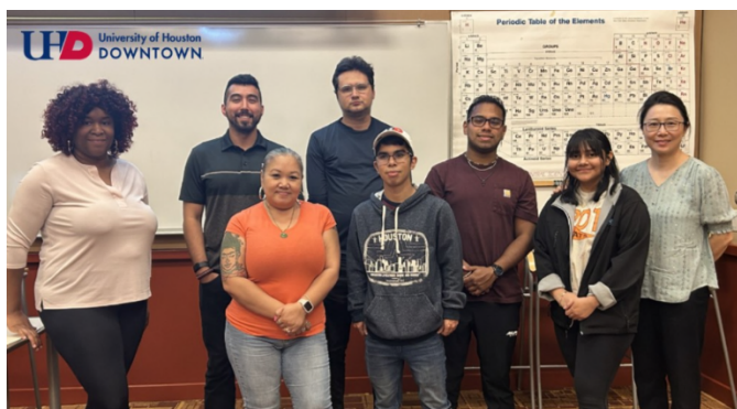
Collaborated with the UHD IA Class of Fall 2025 on Governance & Risk Management. A heartfelt thank you to our volunteer from Deloitte and to the UHD Accounting Program